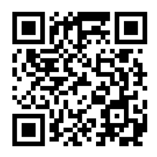
Scan QR code for full golf tournament details

Sponsorship opportunities available, details online: tylerspartans.com/golf